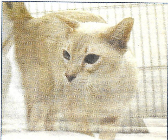
Best of Breed, Lydia Lines' TOSHIKI SILVARA