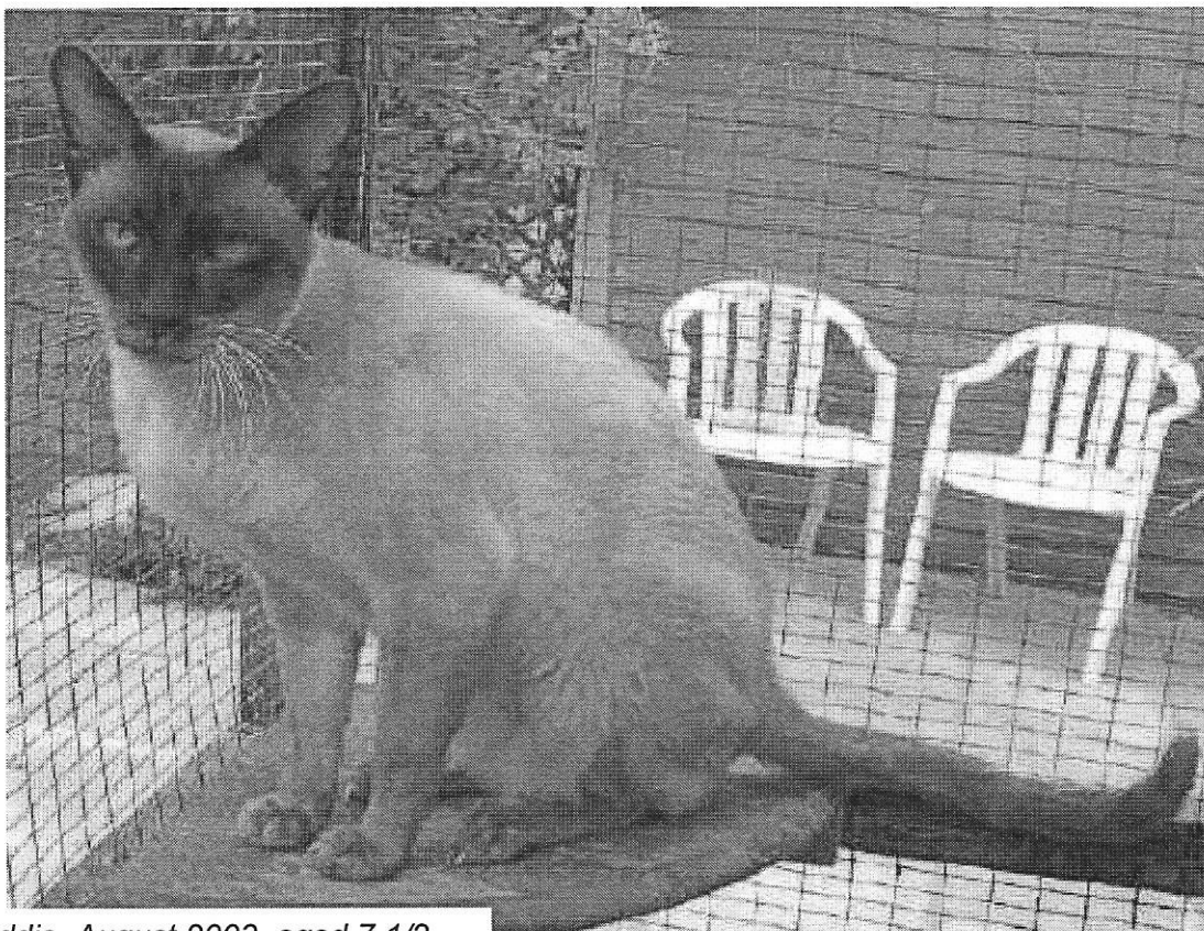
Puddie, August 2003, aged 7 1/2