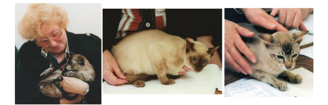
– Helga Dessauer with Melusine Bellaclova ~~ Tonkaholics Arabian Knight ~~ Bonzer Chatterbox