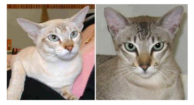
Adfursh Festive Cheer & Adfursh White Tiger

OBIS & BIS Adult - M Lorenzo's Adfursh Festive Cheer (74bt) BIS Kitten - A Crowther's Angisan Vyvera Blueberrypie (74a) BIS Neuter - U Korterman's Adfursh White Tiger (74t)