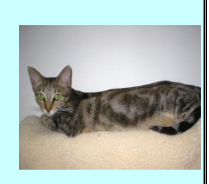
and a Sokoke

Tel: 01303-893958. Mob: 07931342202 e-mail: hylilytonkinese@aol.com