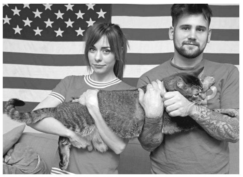
Pickles – the biggest cat!

The Biggest Domestic Moggy This Year – Catasaurus Rex aka Pickles. At 40 inches long and weighing in at 21 lbs, the cat rescued by a Boston couple is not fat just huge. If you don't believe me visit this link: <a href="http://www.dailymail.co.uk/news/article-2559310/Meet-Pickles-three-foot-rescue-cat-weighing-21-pounds-doesnt-realise-size.html">http://www.dailymail.co.uk/news/article-2559310/Meet-Pickles-three-foot-rescue-cat-weighing-21-pounds-doesnt-realise-size.html</a>